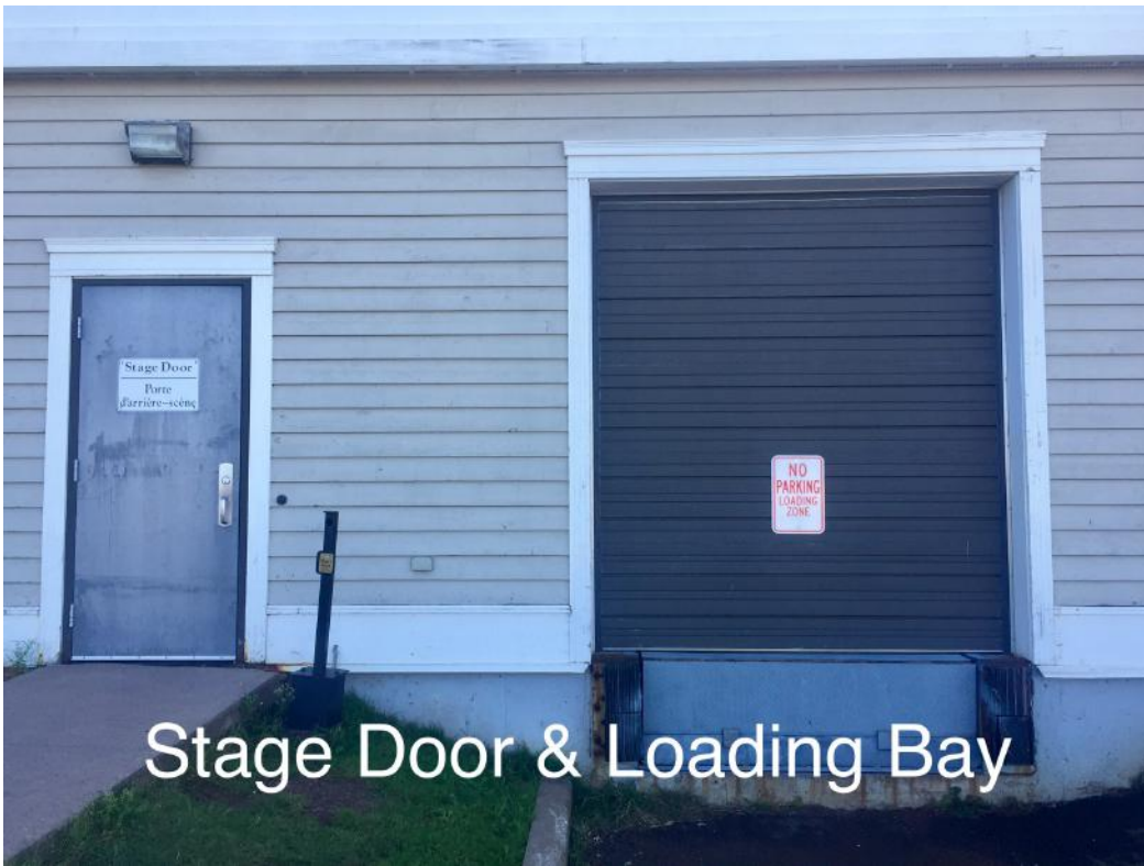
Stage Door & Loading Bay