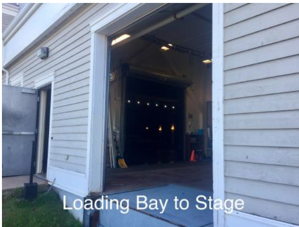
Loading Bay to Stage